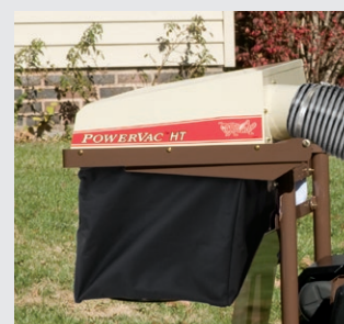
Model 8HT Twin Bag