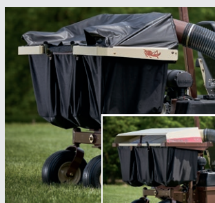
Model 12F Triple Bag