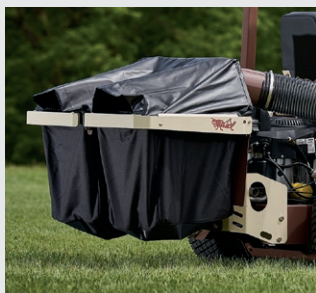
Model 8F Twin Bag