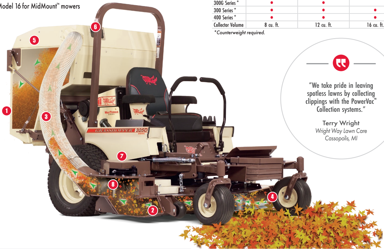
Model 16 for MidMount™ mowers