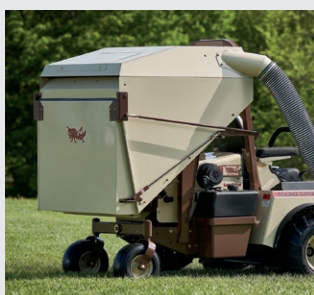
Model 25 Fixed Mount

Weight is distributed across six tires for a lighter footprint requiring no counterweight.