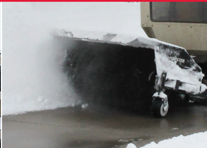
CLEANSWEEP™ ROTARY BROOMS