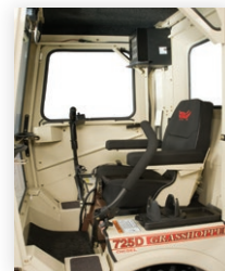
Easy access thanks to standard QuikAdjust Tilt™ levers.