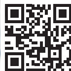
LITTLE BULLY™ DOZER BLADE

Scan this code to view snow removal videos and more.