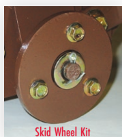
Skid Wheel Kit

An optional electric lift provides more traction on the drive wheels by raising the snowthrower up to 3.5 inches. Electric lift also provides infinite height adjustment to adapt to the application.