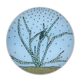
ProLawn Spray Shields "mist that sticks"

The Grasshopper large-capacity Drift-Control Shielded Sprayer is the most productive and cost-effective way to apply liquid fertilizers, pesticides and herbicides to turfgrass.