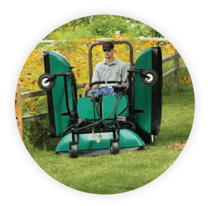
Side curtains fold up for tight spaces.