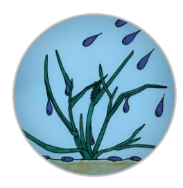
Conventional Spray Systems "hit or miss"

Aerodynamically designed shields with drift-control curtains control chemical spray within the spraying chambers for on-target application, even when spraying in close proximity to ornamental plants, flower beds and water. Sprayers mount to the front of the power unit on MidMount™ models and in place of the outfront cutting deck on FrontMount™ models to retain Grasshopper True ZeroTurn™ maneuverability.